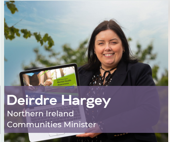
Deirdre Hargey Northern Ireland Communities Minister

“ The quality of the product [from eCoach] is first class and that is shown in the amazing feedback from users.